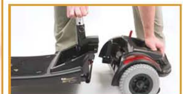
Step 3: Push apart the frame!