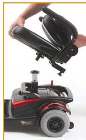
Step 1: Pop off the seat!

Changing shroud colors is a snap with three complete sets of shroud panels in Red, Blue and Sahara.