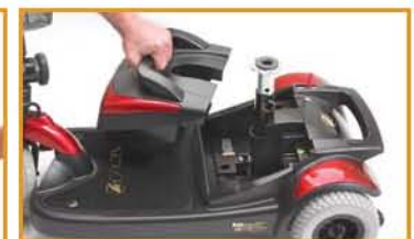
Step 2: Pull off the battery pack!